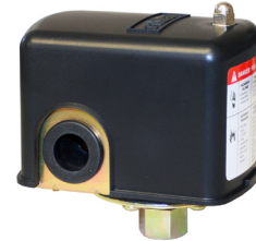
U.S. Patent # D 881,817 and D 949,795