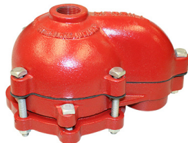
WCB Series Watertight Cap