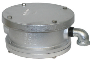
WC Series Watertight Cap

*NOTE: Length of internal parts are bury depth plus 12 inches for well codes, or 4 ft. bury is approximately 5.5 ft. long.